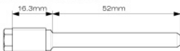
B-TYPE 37mm D58-33-082